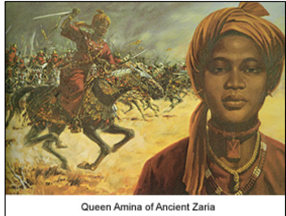
Queen Amina of Ancient Zaria

Much has been said and written about Nigeria, her people and culture, economy and politics, that sheds light on the tremendous potential of this African Giant. However, little is known to the outside world about the many exciting tourist attractions available in Nigeria: Historic sites nestled amid rivers and rain forests, breathtaking mountain vistas, remote creek villages, miles of pristine beaches and exotic national wildlife reserves. There are also museums, festivals, music and dance, a rich cultural melange right down to everyday traditional markets. These are just some of the spectacular sights and sensual delights awaiting the traveler to Nigeria.